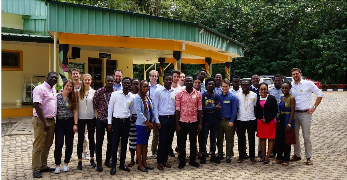
The participants of the joint workshop on Design Thinking at KNUST.