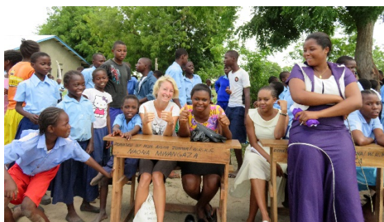
One of the projects in Malindi included developing social, physical and creative activities for the children of the local orphanage.

Currently, three further Bachelor students are in the preparation phase for a stay abroad in 2019. Two of them will do an internship at the school and also collect field data for their Bachelor projects; one student will work in a local hospital and gain experiences regarding the Kenyan health system and healthcare provision.