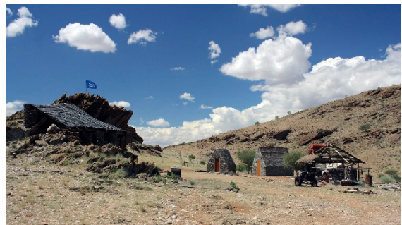
The Rooiklip Research Camp in Namibia.