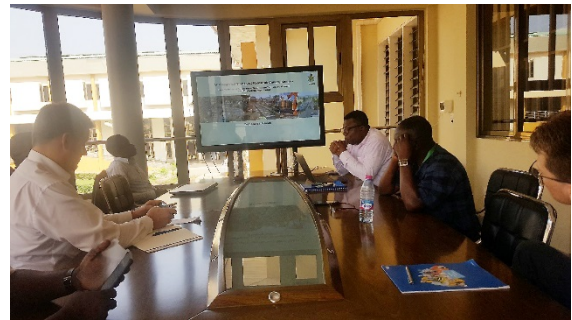
The team of the fact finding mission Sustainable Transport .