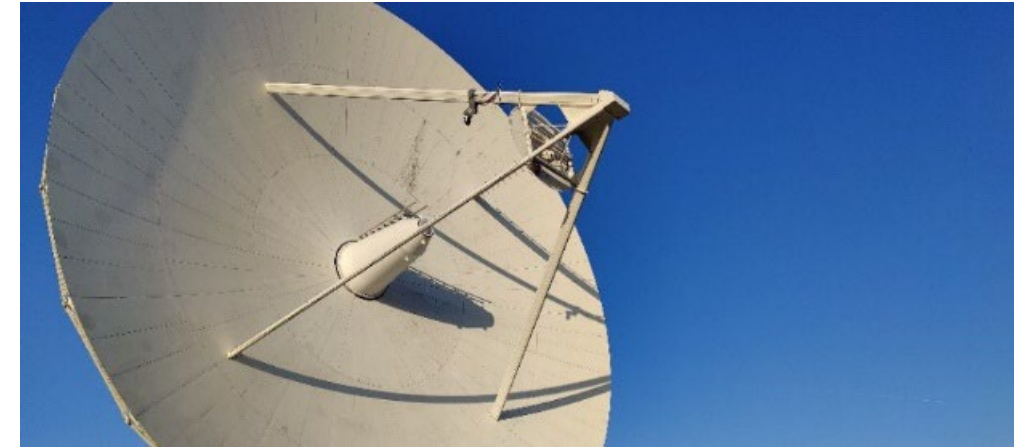
Mounting of Laserscanner in 20 m Radiotelescope Wettzell