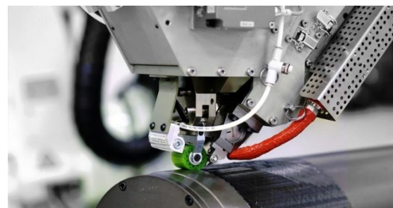
Figure 2 Towpreg laying process in the production of fiber-reinforced components using an AFP system 2

At TUM, we are focusing on the following research areas: