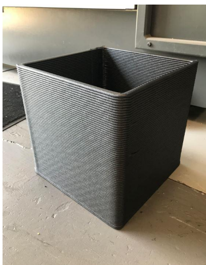
Figure 1: 3D printed test cube